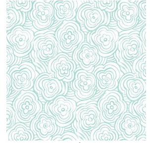
ONDES glacier 43