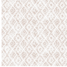
6033 Beige 63 Print pattern