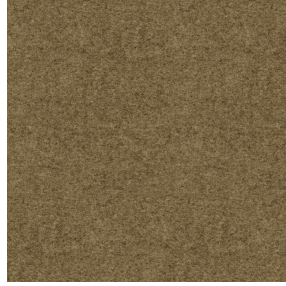
ELAINA Chamois 111 Print pattern