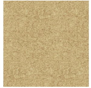
ELAINA Beige 63