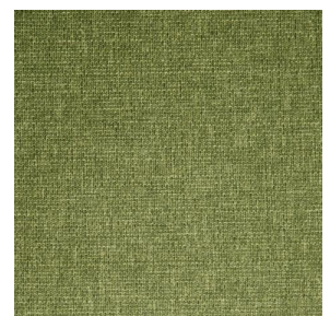
MUNA Olive 61