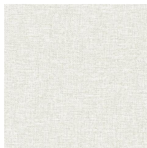
MUNA lin 11