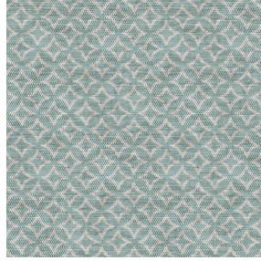
6036 Minéral 157 Print pattern