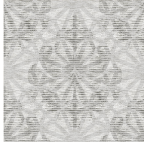
6034 Gris 97 Print pattern