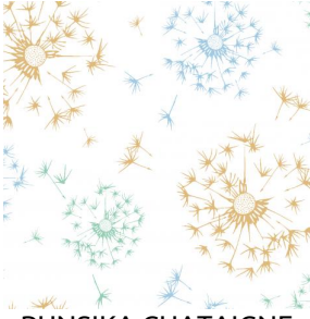
PUNSIKA CHATAIGNE 55