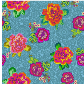
INDRA Fiesta 131 Print pattern