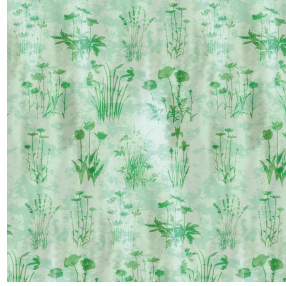
6052 Vert 24 Print pattern