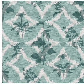
6045 Céladon 135 Print pattern