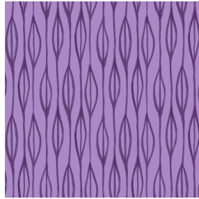
YENDI Lilas 19 Print pattern