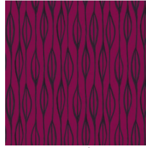
YENDI Opéra 104