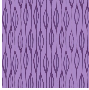
YENDI Lilas 19