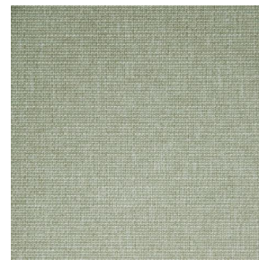
MUNA Sable 67