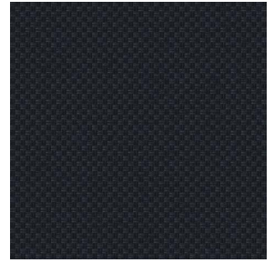
CHARLOTTE Noir 10