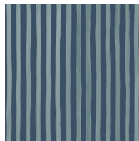
SONG Titanium 98