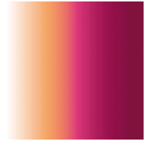
ZENITH Pivoine 57