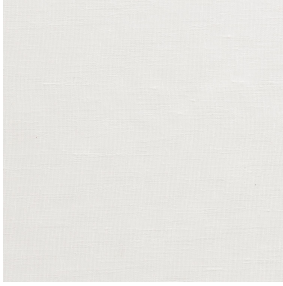
LY BPI 00 Printing support