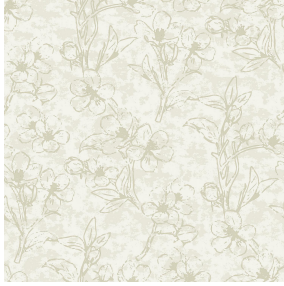
6048 Beige 63 Print pattern