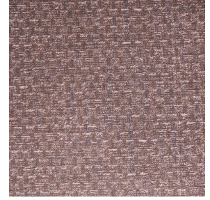
RUSTIC Terre 107