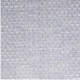
RUSTIC Lin 11