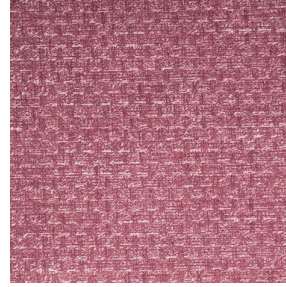
RUSTIC Hortensia 134