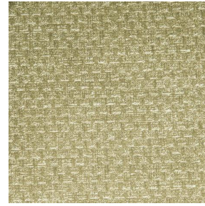
RUSTIC Bergamote 121