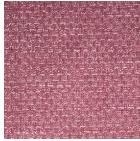
RUSTIC Hortensia 134