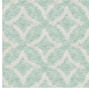
6029 Amande 75 Print pattern