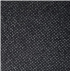
ANATOLE Titanium 98