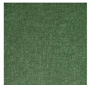
MUNA Lierre 124