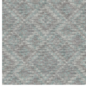
6043 Taupe 95 Print pattern