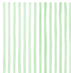
SONG Tilleul 103