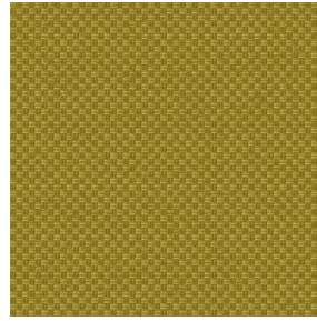
CHARLOTTE Mousse 92