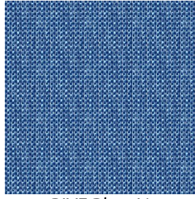
RIVE Bleu 41