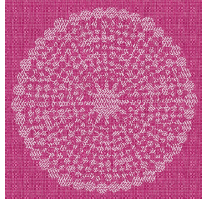
ANGELE Fuchsia 33 Print pattern