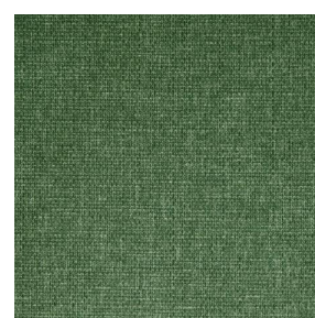
MUNA Lierre 124