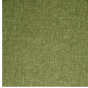
MUNA Olive 61 Print pattern