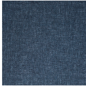
MUNA Indigo 144 Print pattern