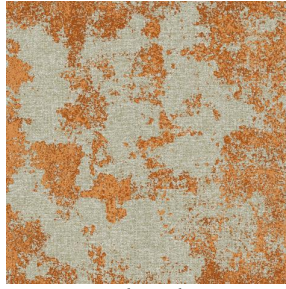
SIERRA chaudron 118