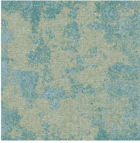
SIERRA brume 47