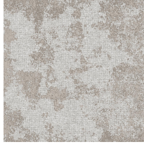
SIERRA ardoise 87 Print pattern