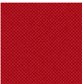
CHARLOTTE Fiesta 131