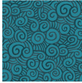
TUMULTE Orage 123