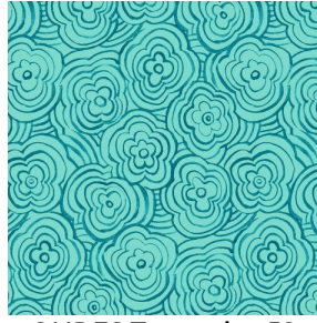
ONDES Turquoise 53