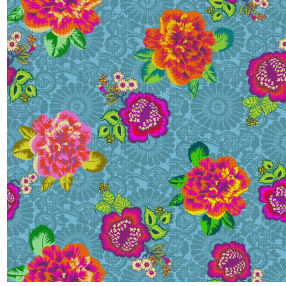
INDRA Fiesta 131 Print pattern