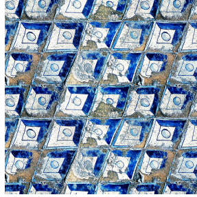
CLEMENTINA Azur 137 Print pattern