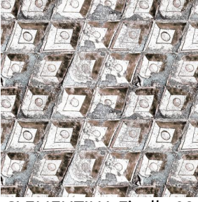
CLEMENTINA Ficelle 09