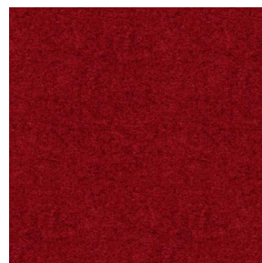
ELAINA Fiesta 131