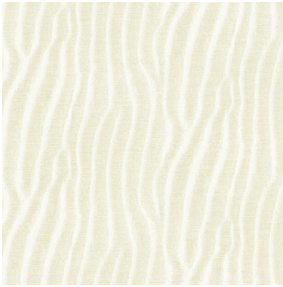
SABLE Ivoire 115