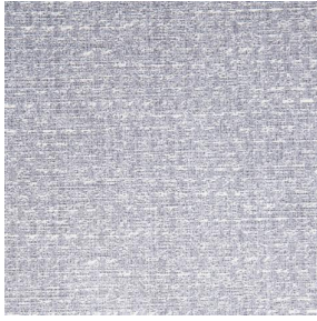
RUSTIC Lin 11