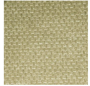
RUSTIC Bergamote 121