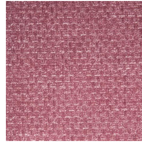
RUSTIC Hortensia 134