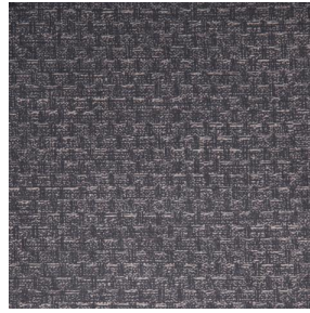
RUSTIC Titanium 98