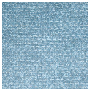
RUSTIC Glacier 43