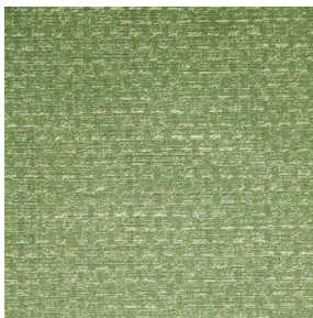
RUSTIC Mousse 92