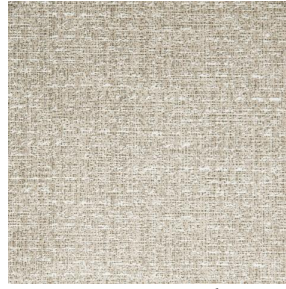
RUSTIC Naturel 26