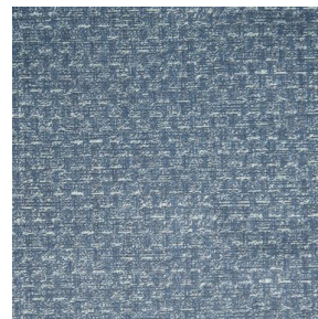
RUSTIC Bleu 41