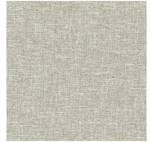
MUNA terre 107