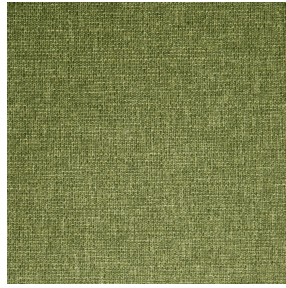
MUNA Olive 61 Print pattern