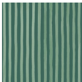
SONG Sapin 126