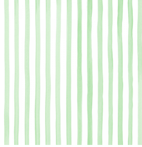
SONG Tilleul 103 Print pattern