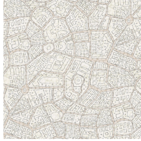
6016 Naturel 26 Print pattern