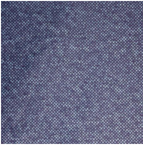
ANATOLE Océan 91