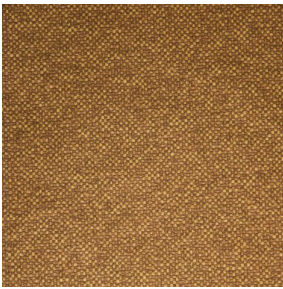
ANATOLE Or 94