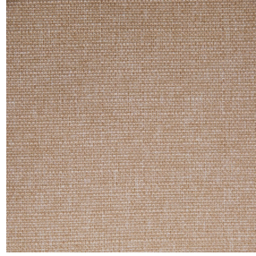
MUNA Saumon 143 Print pattern