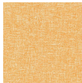
MUNA Melon 22