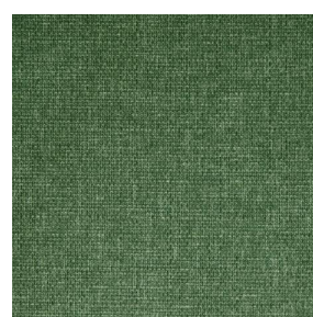
MUNA Lierre 124