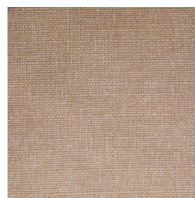
MUNA Saumon 143