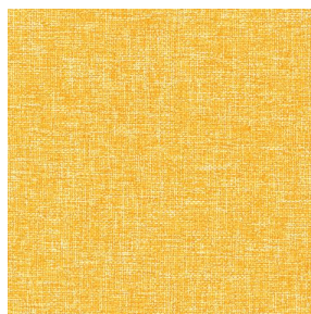
MUNA soleil 90