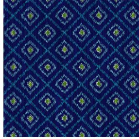
HAMPI Bleu 41 Print pattern