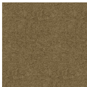
ELAINA Chamois 111