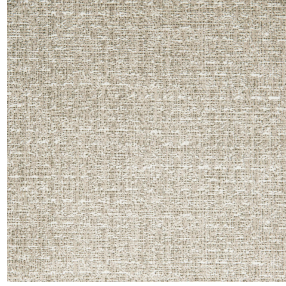
RUSTIC Naturel 26 Print pattern